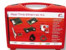
Complete evaluation system: Real-Time-Ethernet Kit