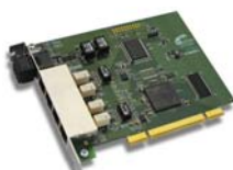
netANALYZER PCI card: NANL-C100-RE