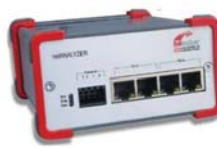
netANALYZER stand-alone box: NANL-B500-RE